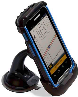
TC55 Vehicle Cradle CRD-TC55-VCD1-01