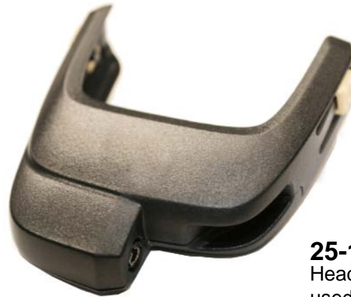
25-154075-01R Headset adapter, to be used with RMN5130A headset for PTT Express.